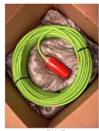
Height: 32 cm Diameter of cable 11 mm